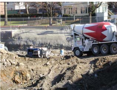
Public Safety Complex Excavation Site

Go see if you can find your brick at the foot of the flagpole!