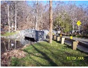
North Porchuck Road Bridge

The Engineering Division has their hand in many projects throughout the