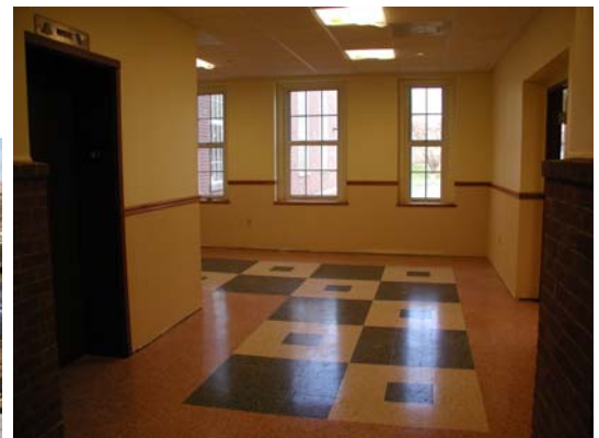
Rehabilitated hallway in the Bendheim Western Greenwich Civic Center