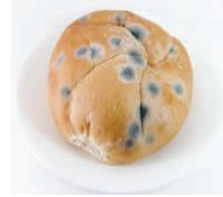
Mold on bread

Mold is virtually everywhere, floating in the air and on all surfaces. Your exposure to mold increases when moldy materials become dried, damaged or disturbed, causing spores and other mold cells to be released into the air and then inhaled. If you handle moldy materials, eat moldy foods or have hand-to-mouth contact you can also be exposed.