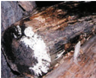
Mold on firewood